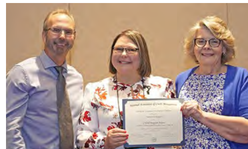
Portland Chapter for its program Six Signs It's a Scam