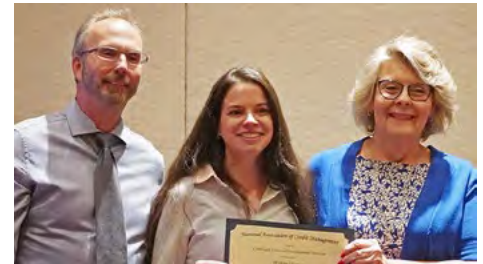
Class B: Wichita Chapter