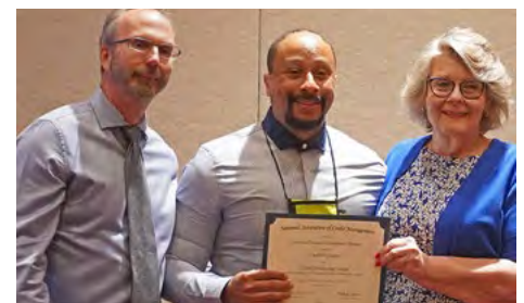
Class A: Charlotte Chapter