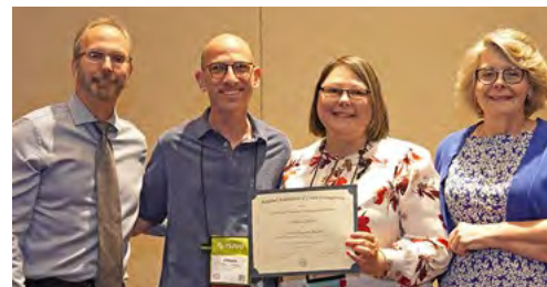
Portland Chapter for its Credit Retreat