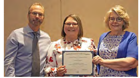
Class A: Portland Chapter