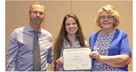
Class B: Wichita Chapter