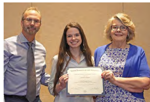
Wichita Chapter for its Excelling at Excel Program