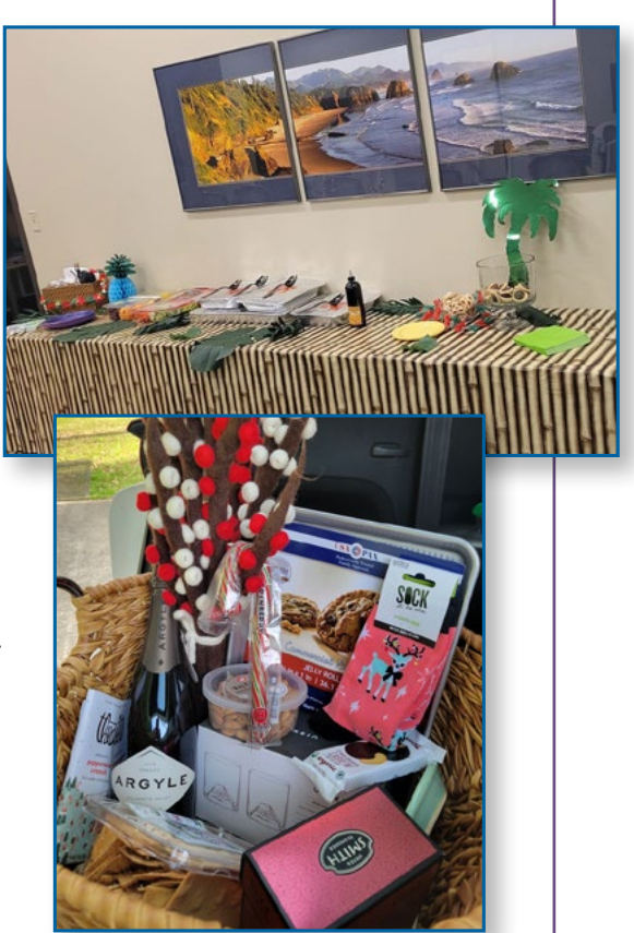
December Raffle Basket