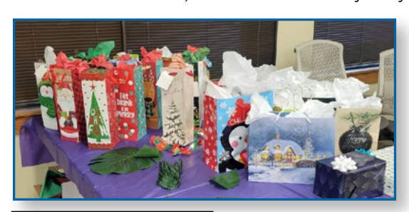
Wine wall & mystery gifts

The holiday party is also the launch of the Chapter's winter fundraiser. From a raffle basket, to wine wall and mystery gifts, we had it all.