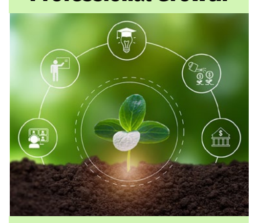
33 CFDD Members have received a scholarship to attend NACM's 2024 Annual Credit Congress