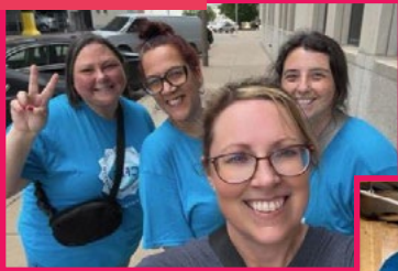
Day of Service