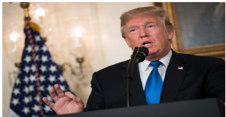
WASHINGTON, DC - OCTOBER 13: U.S. President Donald Trump makes a statement on the administration's strategy for dealing with Iran, in the Diplomatic Reception Room in the White House, October 13, 2017 in Washington, DC. President Trump stated that the Iran nuclear deal is not in the best interests for the security of the United States, but stopped short of withdrawing from the 2015 agreement. [-]

Opinions expressed by Forbes Contributors are their own.